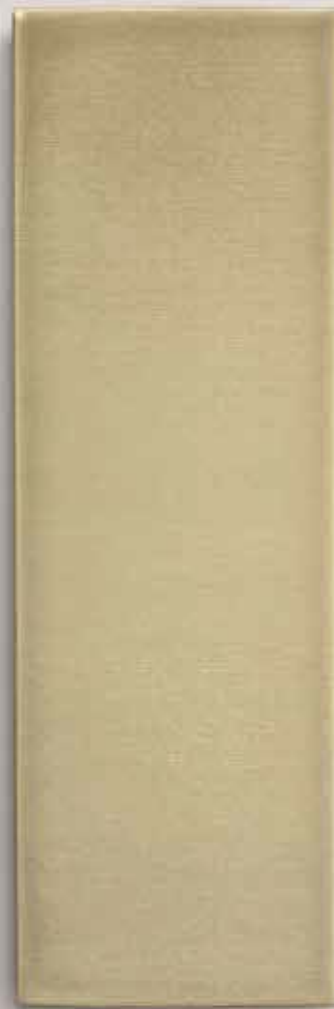
Sand - 6" x 18" (22402)