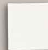
Sail - 3" x 3" (22303)