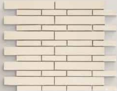
Sunlight - 11 5/8" x 10 3/8" Mosaic (22605)