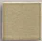
Sand - 3" x 3" (22403)