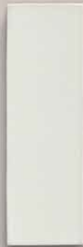
Sea - 3" x 9" (22501)