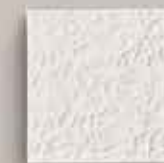
Sail Deco - 3" x 3" (22304)