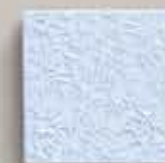
Breeze Deco - 3" x 3" (22104)