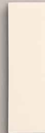
Sunlight - 3" x 9" (22601)