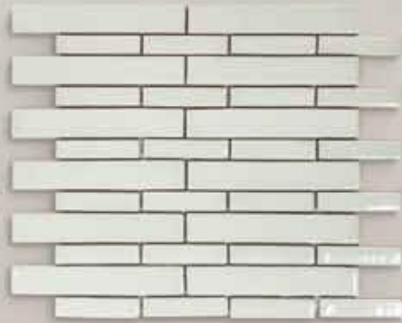
Sea - 11 5/8" x 10 3/8" Mosaic (22505)