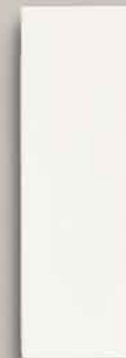
Sail - 3" x 9" (22301)