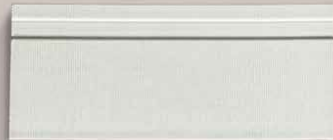
3 3/4" x 9" Base