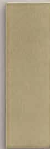
Sand - 3" x 9" (22401)