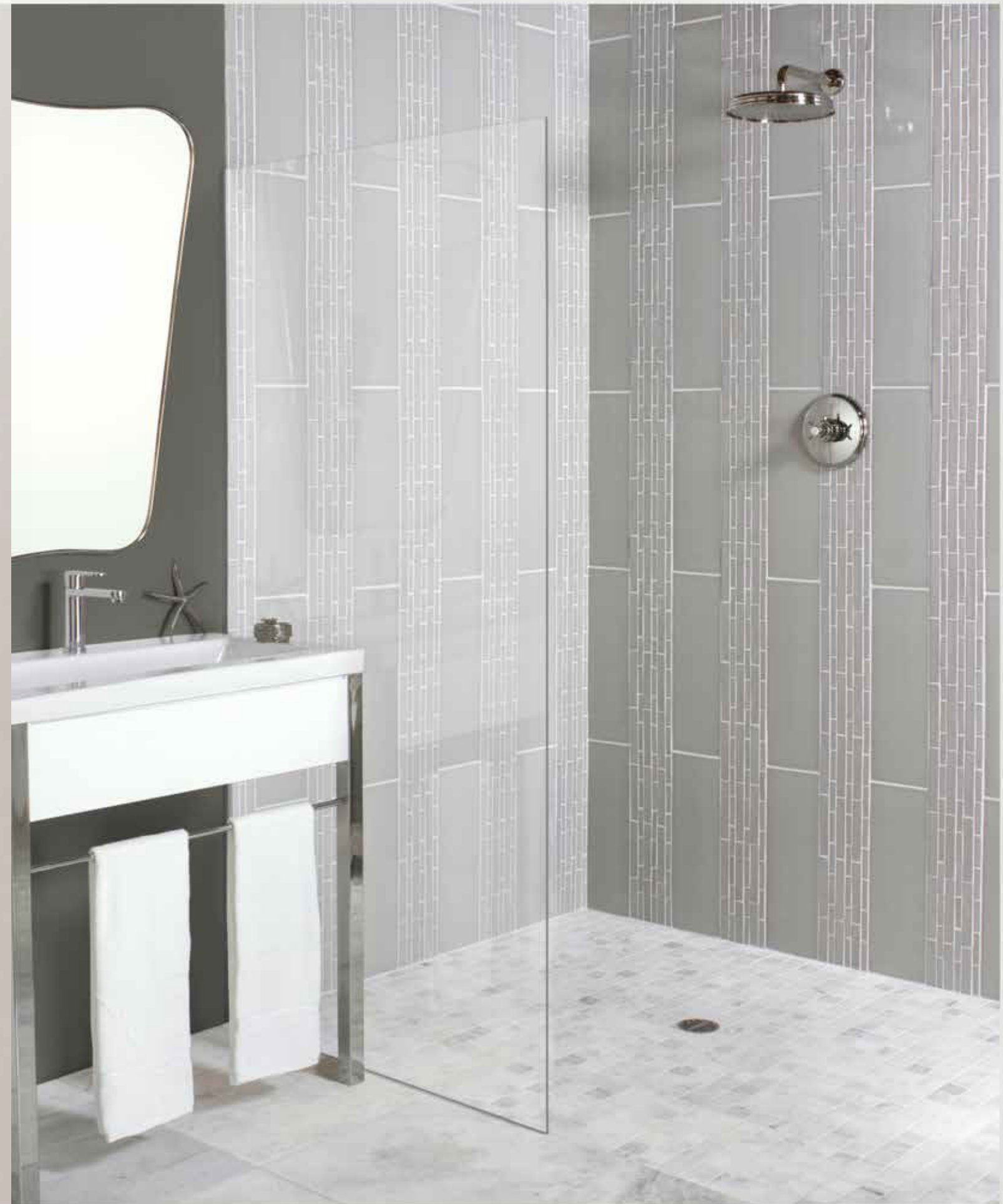
Pictured: Mist - 6" x 18" Field Tile, Mosaic 11 5/8" x 10 3/8"