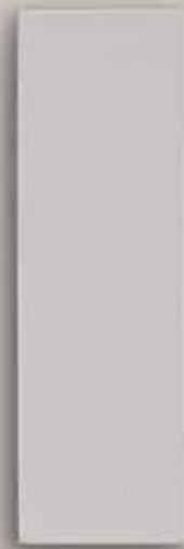
Mist - 3" x 9" (22201)