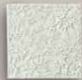
Sea Deco - 3" x 3" (22504)