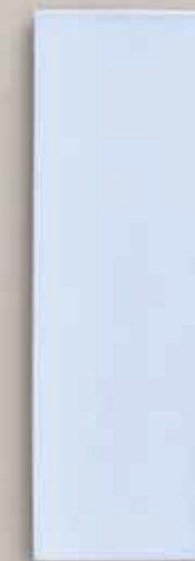
Breeze - 3" x 9" (22101)