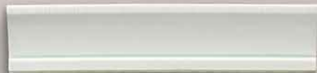
2" x 9" Crown

Available in all six field colors - Gloss Finish