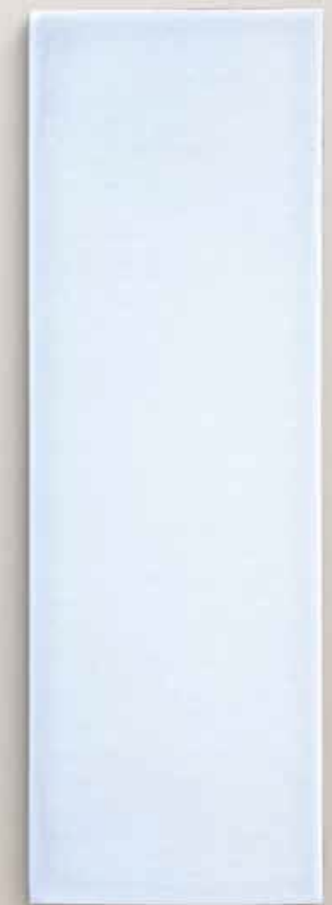
Breeze - 6" x 18" (22102)