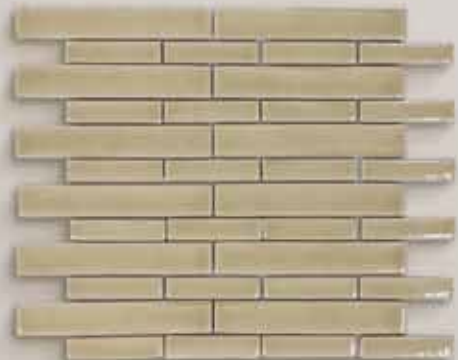
Sand - 11 5/8" x 10 3/8" Mosaic (22405)