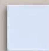
Breeze - 3" x 3" (22103)