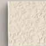
Sunlight Deco - 3" x 3" (22604)