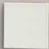
Sea - 3" x 3" (22503)