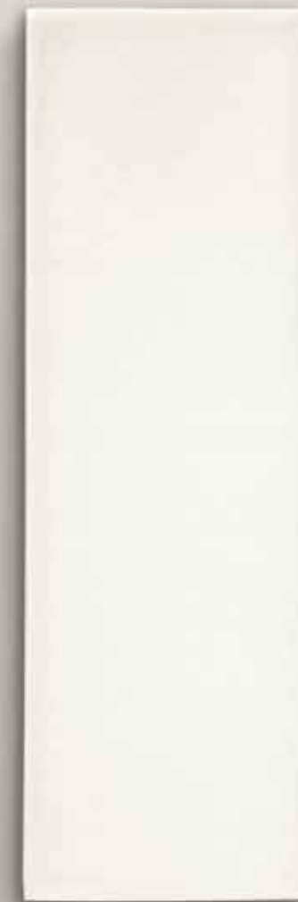
Sail - 6" x 18" (22302)