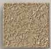
Sand Deco - 3" x 3" (22404)