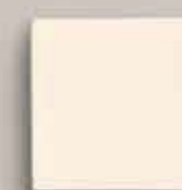
Sunlight - 3" x 3" (22603)