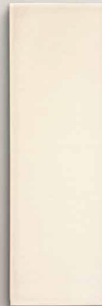
Sunlight - 6" x 18" (22602)