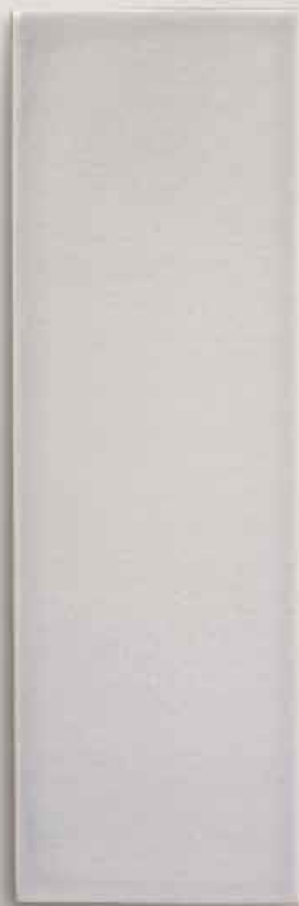
Mist - 6" x 18" (22202)