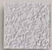
Mist Deco - 3" x 3" (22204)