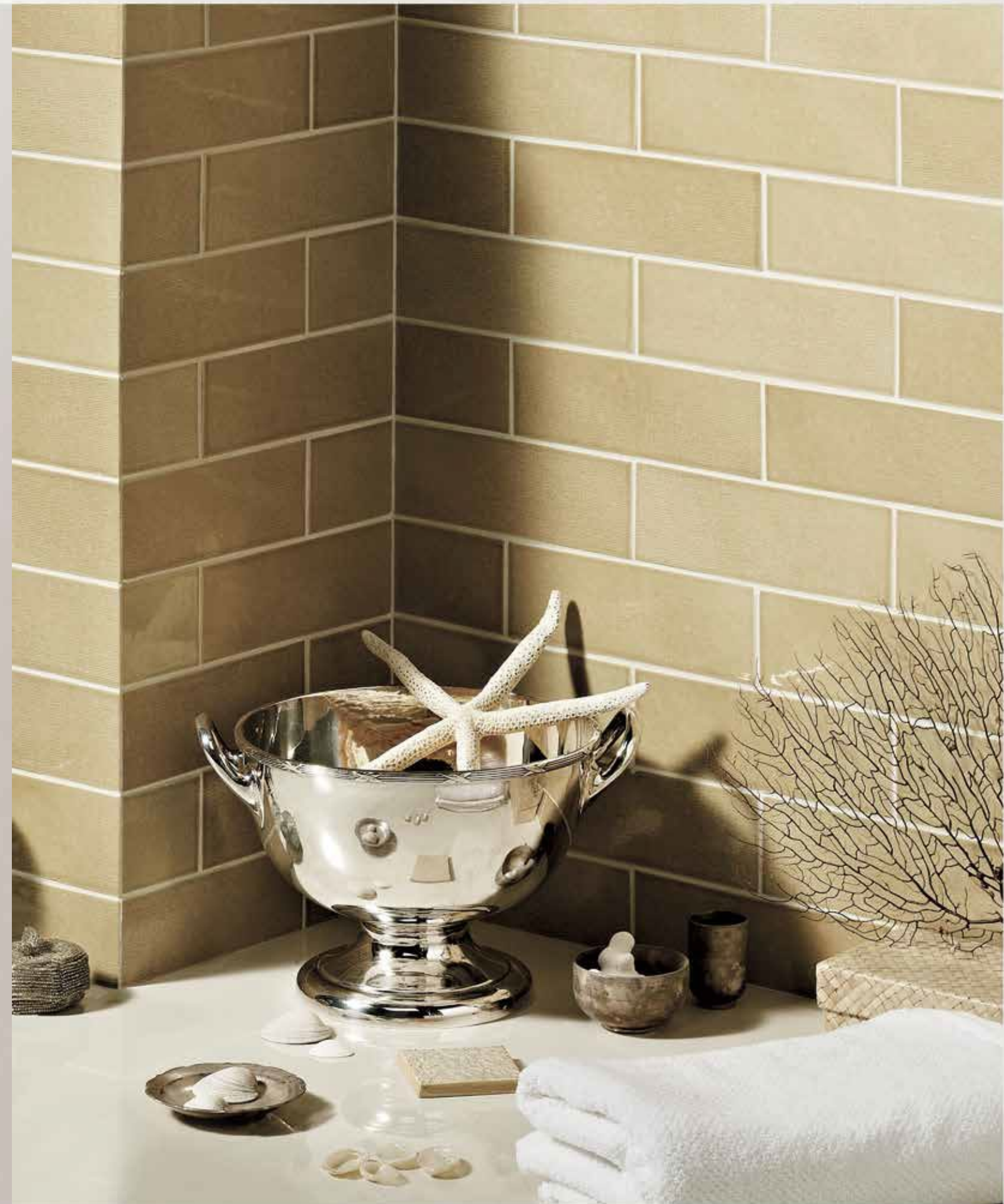
Pictured: Sand - 3" x 9" Field Tile.