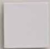
Mist - 3" x 3" (22203)