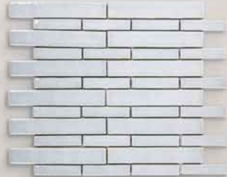
Breeze - 11 5/8" x 10 3/8" Mosaic (22105)