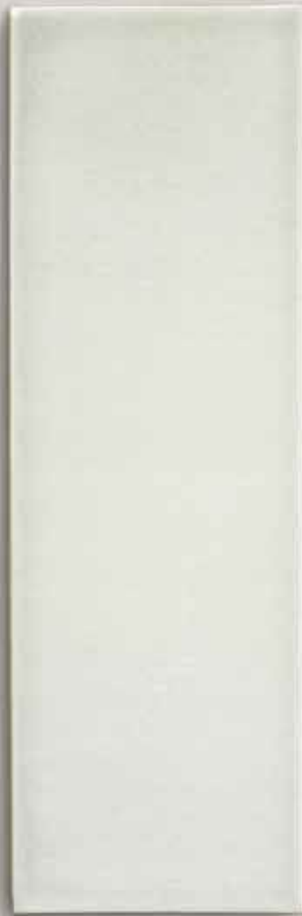
Sea - 6" x 18" (22502)