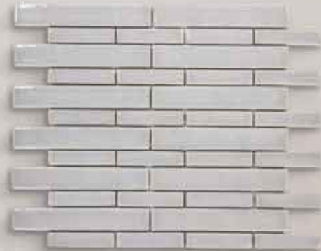
Mist - 11 5/8" x 10 3/8" Mosaic (22205)