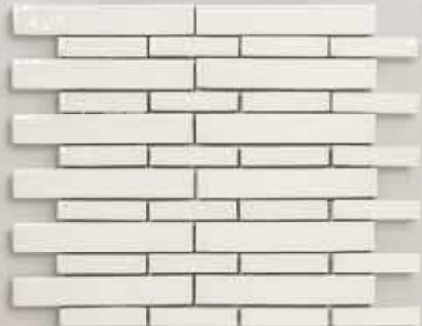
Sail - 11 5/8" x 10 3/8" Mosaic (22305)